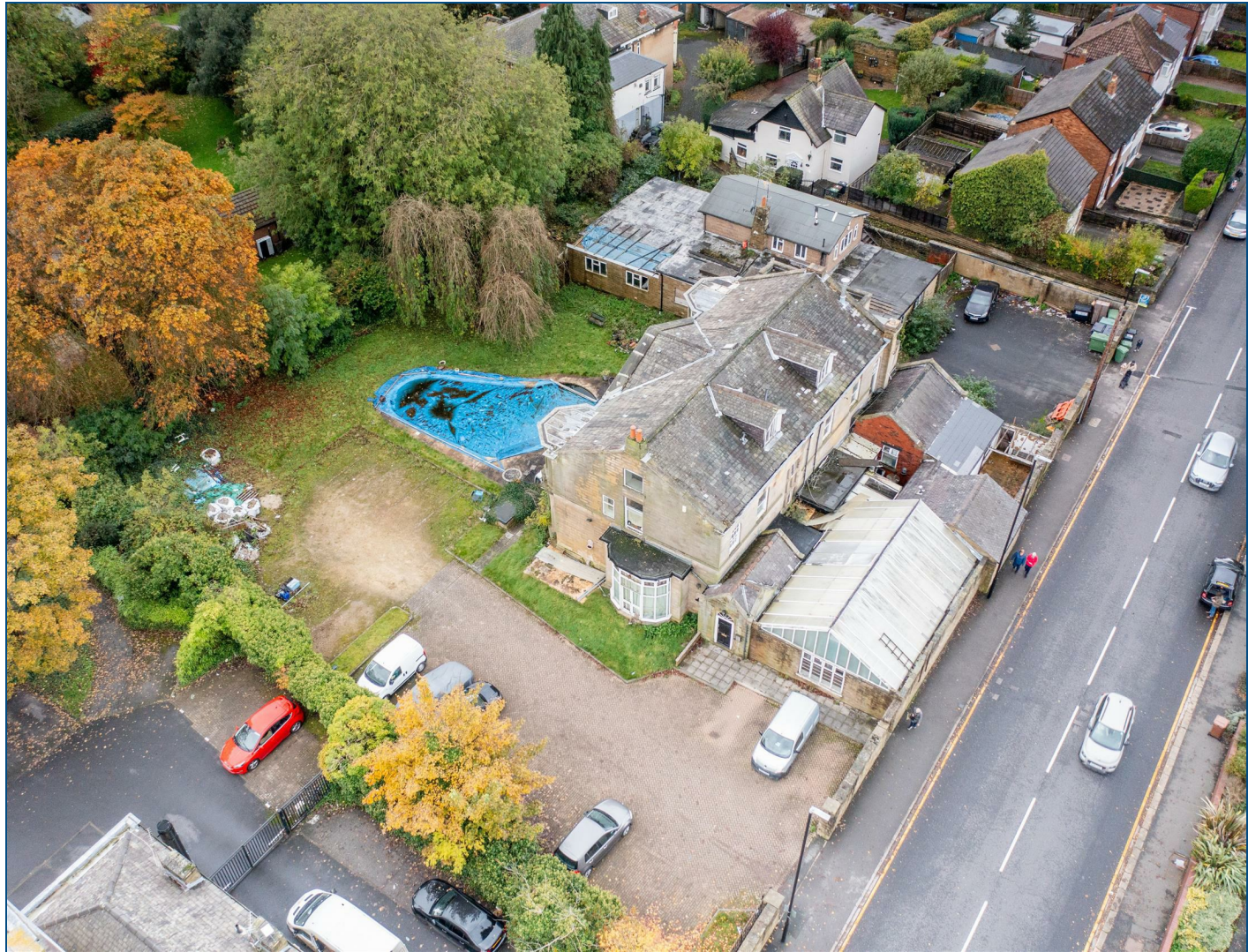
Spring Vale, Stainbeck Lane, Chapel Allerton, LS7 3PJ £1,850,000

Disclaimer- You may download, store and use the material for your own personal use and research. You may not republish, retransmit, redistribute or otherwise make the material available to any party or make the same available on any website, online service or bulletin board of your own or of any other party or make the same available in hard copy or in any other media without the website owner's express prior written consent. The website owner's copyright must remain on all reproductions of material taken from this website. Stoneacre Properties acting as agent for the vendors or lessors of this property give notice that:- The particulars are set out as a general outline only for the guidance of intending purchasers or lessees, and do not constitute, nor constitute part of, an offer or contract. All descriptions, dimensions, condition statements, permissions for use & occupation, and other details are given in good faith and are believed to be correct. Any intending purchasers or tenants should not rely them as such as statements or representations of fact but must satisfy themselves by inspection or otherwise as the correctness of each of them. No person in the employment of Stoneacre Properties has any authority to make or give representation or warranty whatsoever in relation to this property. These details believe to be correct at the time of compilation, but may be subject to subsequent amendment.